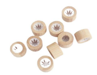
Eco Fabric Band Eco Bamboo Barrel Lock