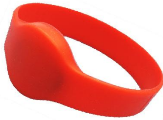
WR01 Round Dial